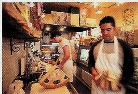
POND LIFE: Clockwise from above, residents frolic around Fresh Pond; gourmet fixings at Formaggio Kitchen; sleek home furnishings at Oblio.